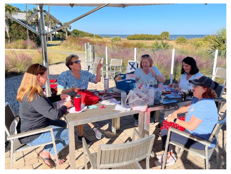
GFWC Florida members sewing Camp Boggy Creek bears poolside! Always having fun when there is work to do!

Participating states include Florida, Alabama, Mississippi, South Carolina and Georgia. Over 200 clubwomen from all (5) states came together for fellowship and friendship!